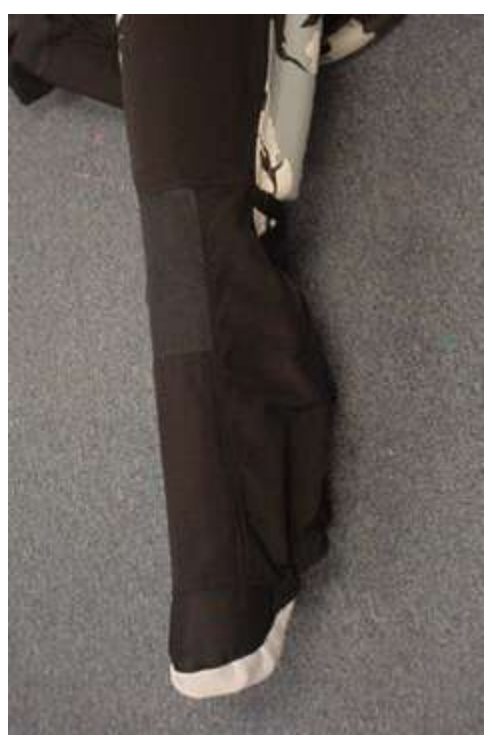
Vented Mega Bootie

The VENTED BOOTIE option has an air inlet that traps the air to slow you down, for more leg action and better tracking.