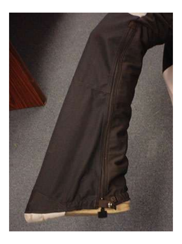
Mega Bootie with the leg zip option.

The MEGA BOOTIE has a straight line from the knee to the toe and has a larger surface area for turning quick pieces, also can be ordered with the leg zip option for ease when putting the suit on.